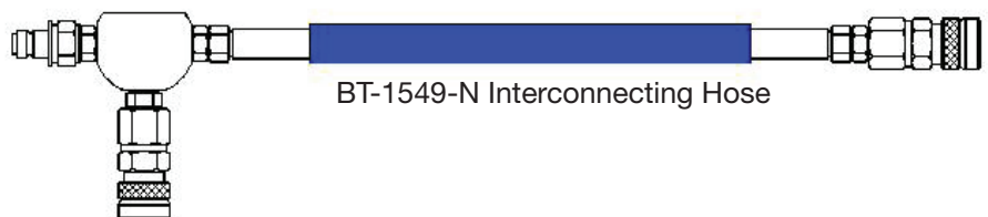
BT-1549-N Interconnecting Hose