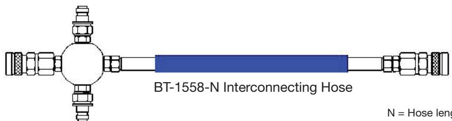
BT-1558-N Interconnecting Hose